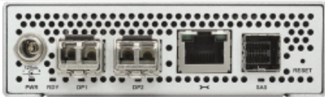
IP Bridging Module Back Plane

Easily map tape drives to one or more hosts - and remap if necessary due to failures or maintenance downtime using a command line interface or the web based management console. The tape drives respond as if directly connected to the hosts.